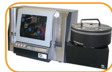
Optional 6-hopper carousel